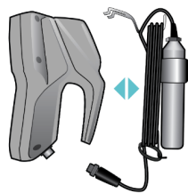
Hand unit Sensor with cable