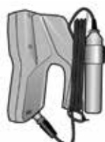
Sensor attached to MultiTracker