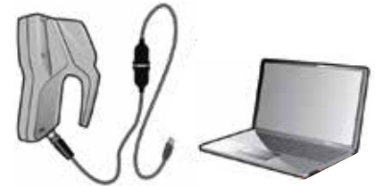
USB Download Cable P/N 11901057DATA