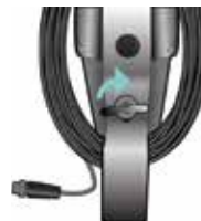
Easy to change sensor