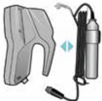
MultiTracker Sensor with cable & hook