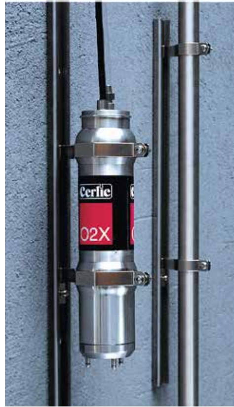
SS Slide rail assembly for easy installation and servicing. Available in two sizes 20 mm Ø for pHX, ReX and FLX and 66 mm Ø for O2X and ITX sensors. The rail has field adjustable stop. It's easy to install and to inspect sensors for cleaning and calibration.