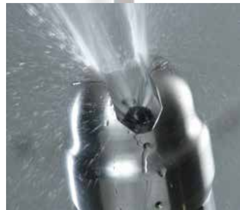
The automatic flushing device has no moving parts and ensures minimal maintenance and enhanced reliability. The flushing nozzle uses water or compressed air.