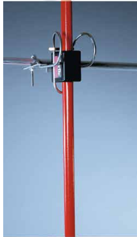
The flexible spring-loaded mounting bracket is designed to withstand turbulent conditions. The fiberglass telescopic rod is extendable to 4 meters and can be removed easily for inspection.