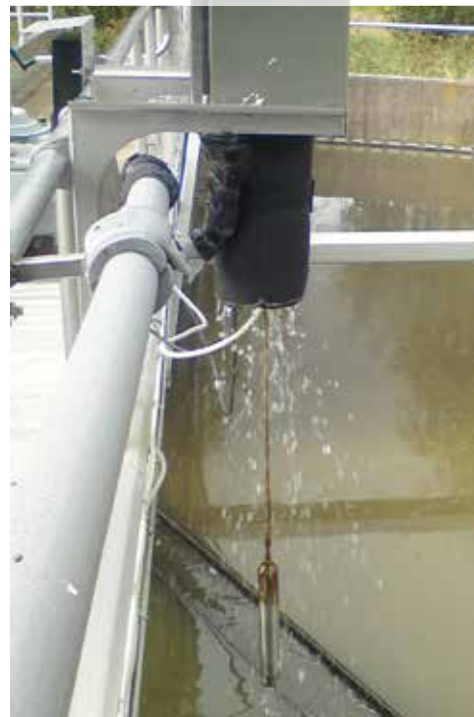
CBX with mounting assembly for easy attachment to handrail. Automatic flushing system of cable and sensor after each cycle.