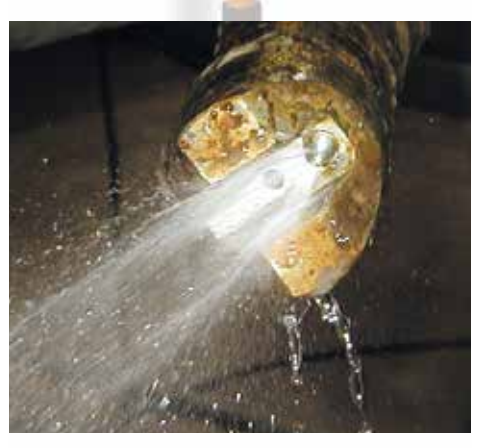
The automatic flushing device has no moving parts and ensures minimal maintenance and enhanced reliability. The flushing nozzle uses water or compressed air.