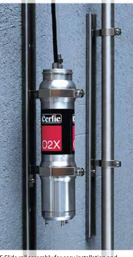
SS Slide rail assembly for easy installation and servicing. Available in two sizes 20 mm Ø for pHX, ReX and FLX and 66 mm Ø for O2X and ITX sensors. The rail has field adjustable stop. It's easy to install and to inspect sensors for cleaning and calibration.

The flexible spring-loaded mounting bracket is designed to withstand turbulent conditions. The fiberglass telescopic rod is extendable to 4 meters and can be removed easily for inspection.